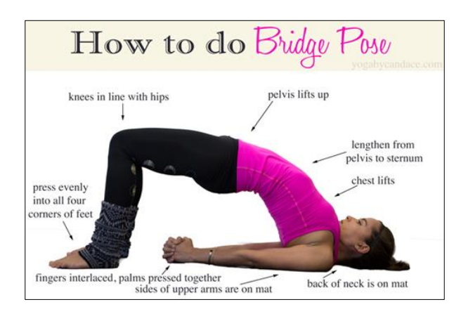
Fig 2: Bridge Pose

Bridge Pose improves posture and counteracts the effects of prolonged sitting and computer work. It may help relieve low back pain and can counteract slouching and kyphosis (abnormal curvature of the spine). The pose gently stretches your abdomen, chest, and the area around your shoulders while strengthening your back muscles, buttocks (glutes), thighs, and ankles.